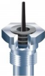
Type 1 - Central Pull